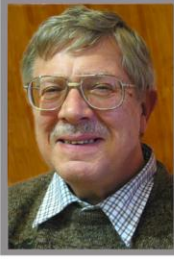
Exploring the Past Shirley Knight