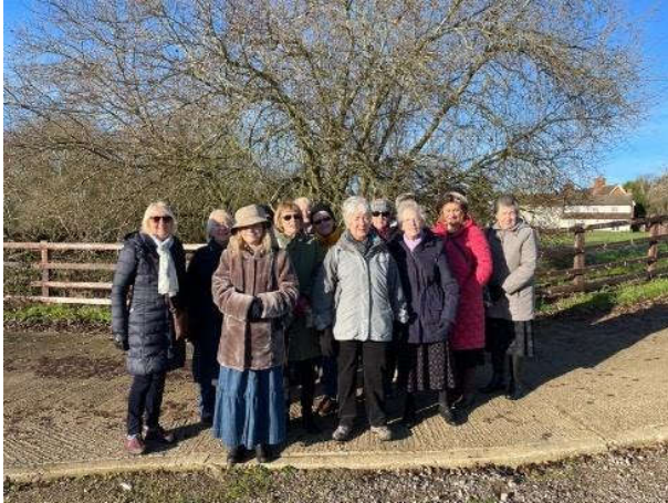
Local walk around Maids Moreton in January