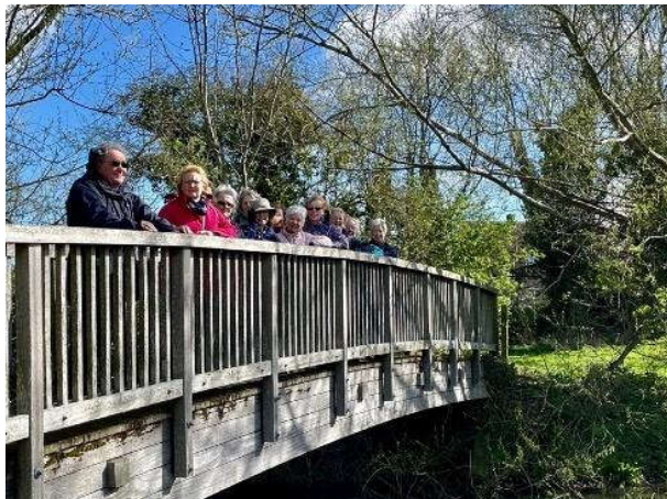
A sunny day in April at Stony Stratford