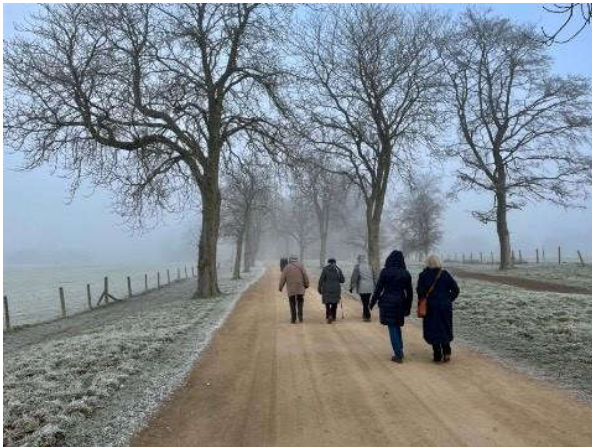
A freezing cold, misty morning at Stowe in February