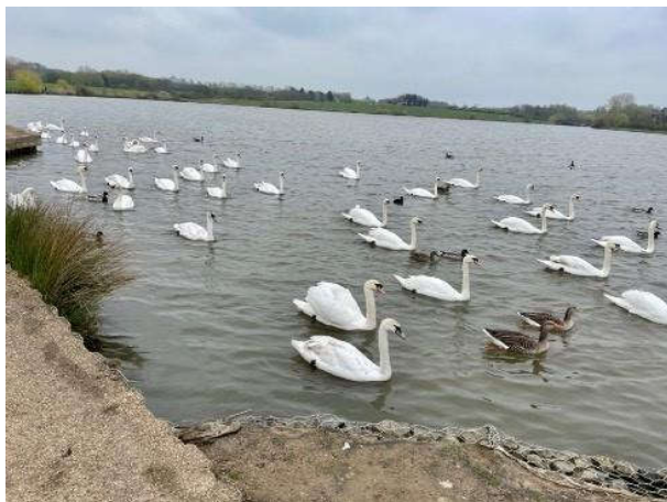
April - not so sunny, but a lovely walk around Furzton Lake, renamed Swan Lake!