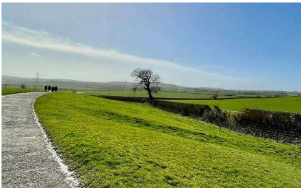
Beautiful view around Botolph Claydon in March