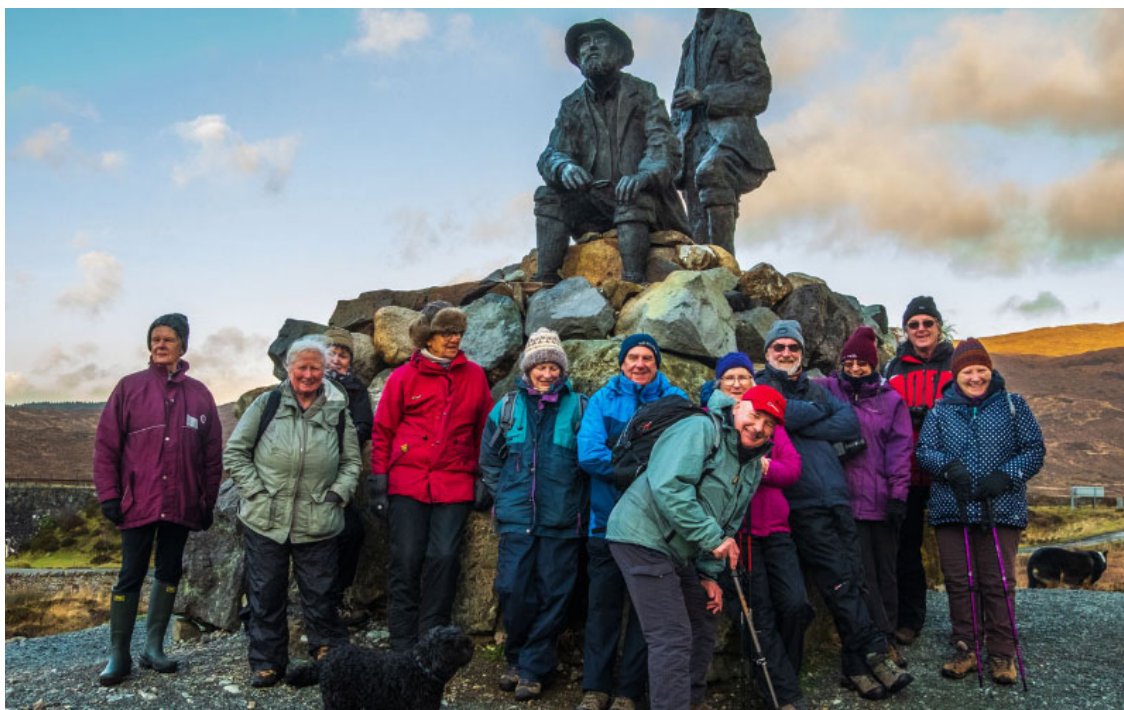
The Isle of Skye u3a Step-it-up walking group at Sligachan, against the backdrop of the Cuillin Mountains.

Click here to open the newsletter in your browser.