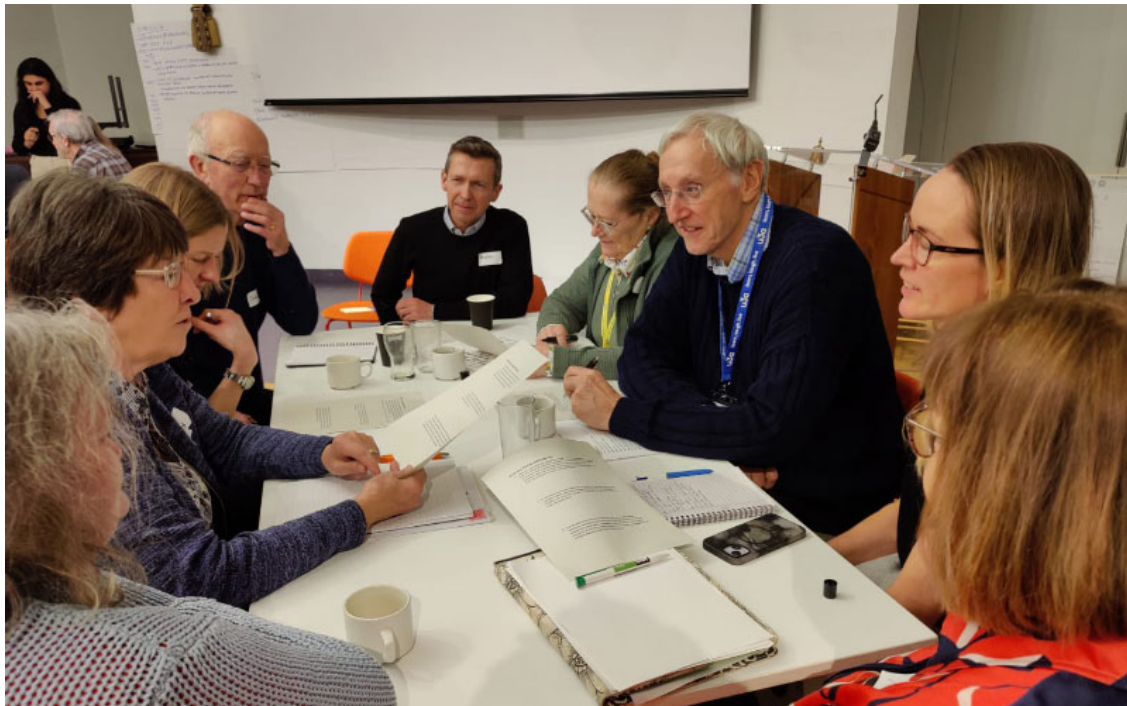
The Board of Trustees and members of u3a office sharing ideas with each other at a strategy day.

Book now on Eventbrite and please submit questions by 10 February to ceo@u3a.org.uk