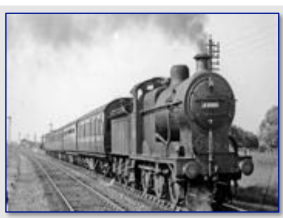
The glorious days of steam.

If you're interested, please use the above email. We already have a willing co-ordinator and just need people and a venue!