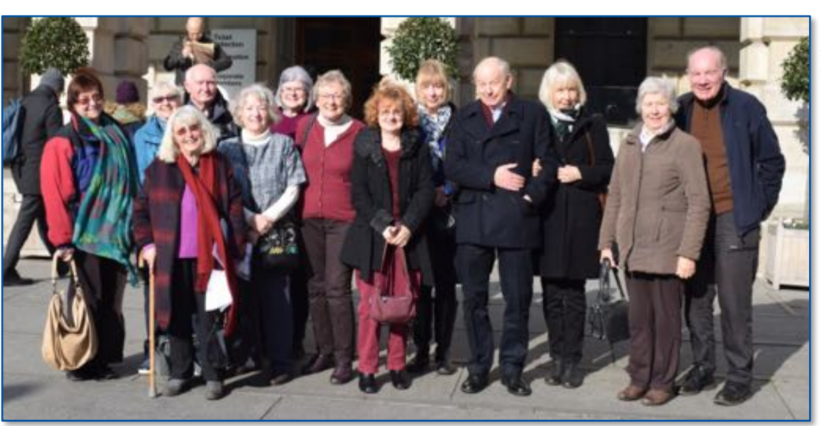
The Art Appreciation group, on their visit to the Royal Academy to view the exhibition, Revolution.

The group meets on the first Friday of each month at 10.15am in the Mezzanine Suite at the Buckingham Centre, Verney Close. For regular updates, please visit our page on the website.