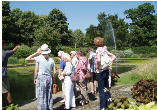
The cooling waters at Hillesden House

Thanks to the many people who have given their time and enthusiasm our visits have not only been informative but also entertaining. It was a snowy day when the group went back in time in the lofty heights of Grafton Regis where village residents dressed up to tell us of the role their village played in the marriage between Edward IV and Elizabeth Woodville and the murder of her sons in the Tower, also about Henry VIII's palace in the village and its destruction during the Civil War. They also provided us with homemade hot soup and rolls which was greatly appreciated. We also enjoyed guided tours of Maids Moreton, Towcester, Lillingston Dayrell Church, and the John Schorne Well at North Marston. We also learnt of the important role Whitchurch played during the last war. Our guide to the Ashmolean Museum told us so much about the history of the museum itself, its new architecture and its exhibits that most of us could have spent a week there and our visit to the museum and excavations at Piddington Roman Villa made some of us want to get down on our hands and knees to help dig.