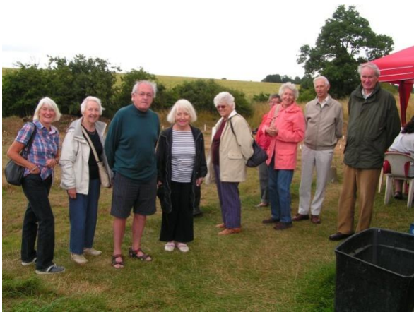
Digging up the Romans at Piddington!