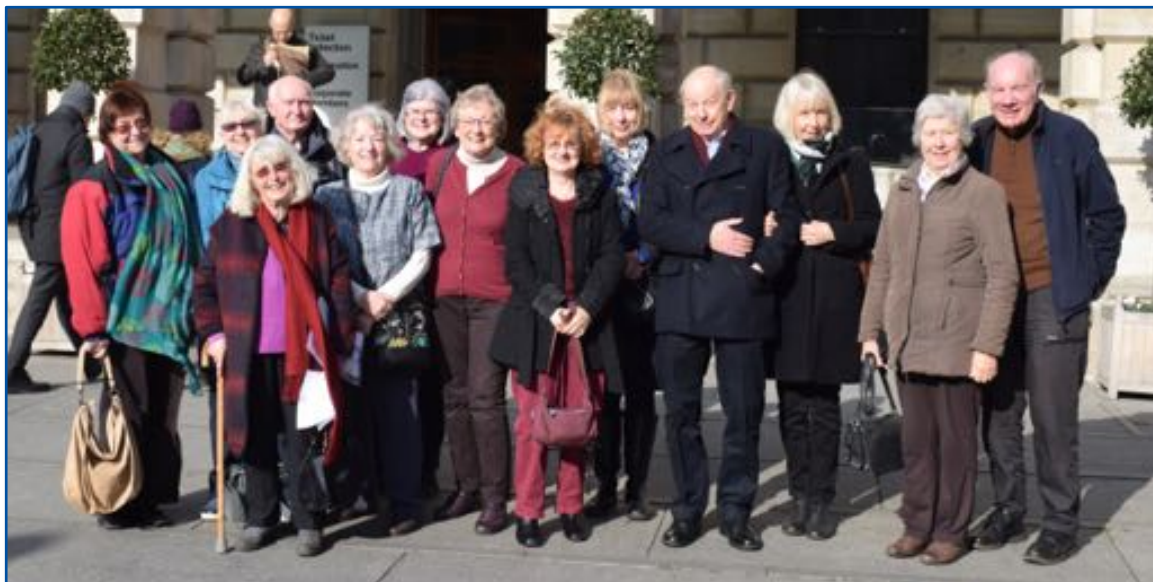
The Art Appreciation group, on their visit to the Royal Academy to view the exhibition, Revolution.

The group meets on the first Friday of each month at 10.15am in the Mezzanine Suite at the Buckingham Centre, Verney Close. For regular updates, please visit our page on the website.