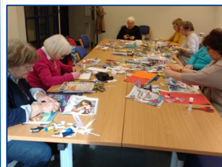
Concentrating hard at New to Drawing.

This group, which meets between 1pm – 3pm on 1 st and 2 nd Wednesdays, has changed its venue and now meets in the mezzanine room at the library (formerly in The Centre, Verney Close).