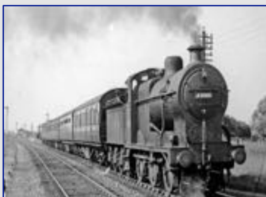
The glorious days of steam.

If you're interested, please use the above email. We already have a willing co-ordinator and just need people and a venue!